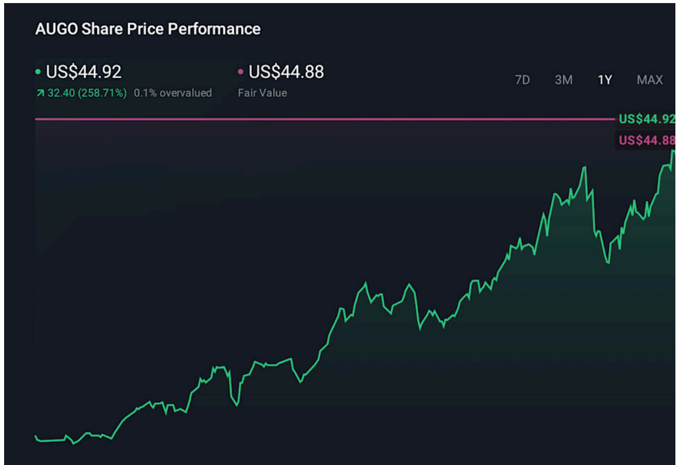
AUGO 1-Year Stock Price Chart

Some of the most optimistic analysts were already penciling in about US$2.1 billion of revenue and US$1.0 billion of earnings by 2028, so Era Dorada's approval may either reinforce or challenge those expectations depending on how you weigh its added growth potential against the risk of multi project execution setbacks in Guatemala and elsewhere.